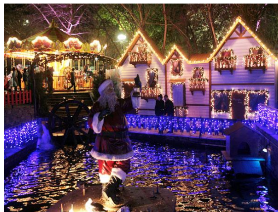
Oneiroupoli of Drama on December