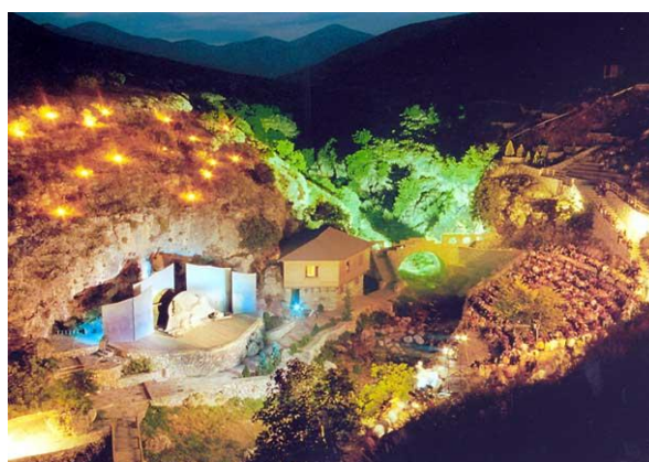
Theatrical and musical nights by the gorge in Petrousa