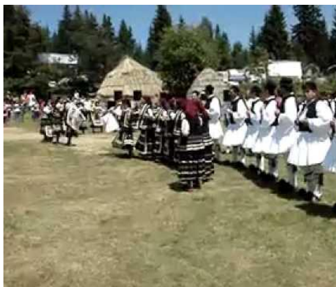
The annual meeting of Sarakatsans at the forest village of Elatia on the 20th of July

The company and its specialized associates are waiting for you at their base at "Cafe Therapeftirio", to offer you, with love and care, activities in nature in Paranesti, Drama. Right on the banks of Nestos River, all the team offers countless actions for your "therapy"!