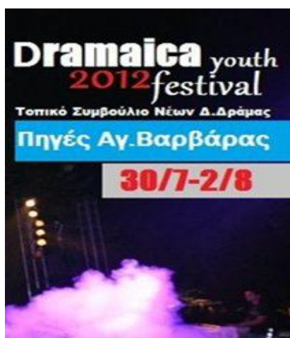
Dramaica youth festival on August