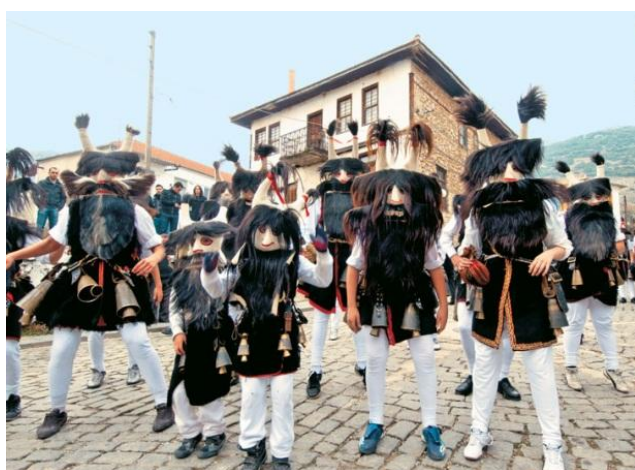
Babougera in Kali Vrisi and Xiropotamos on January